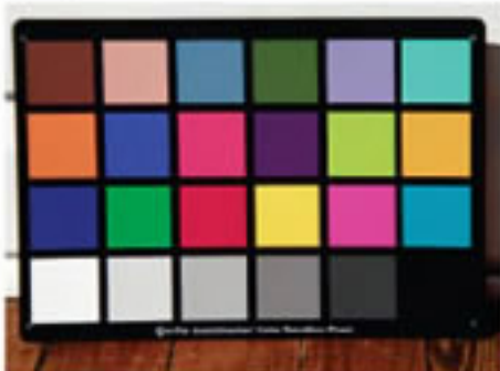
Color chart under yellow light