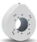
Junction Box (PR-B37JB) is available