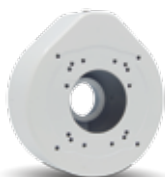
Junction Box (PR-B20JB) is available

Sensor: 1/3", 1.3 Mega-Pixel Selectable output-720P AHD/Analog Lens: 2.8-12mm Mega-Pixel Fixed True Day & Night – ICR IR Range: 35m (42 IR LED) IP66 Weight: 836g Power: DC 12V, ~380mA